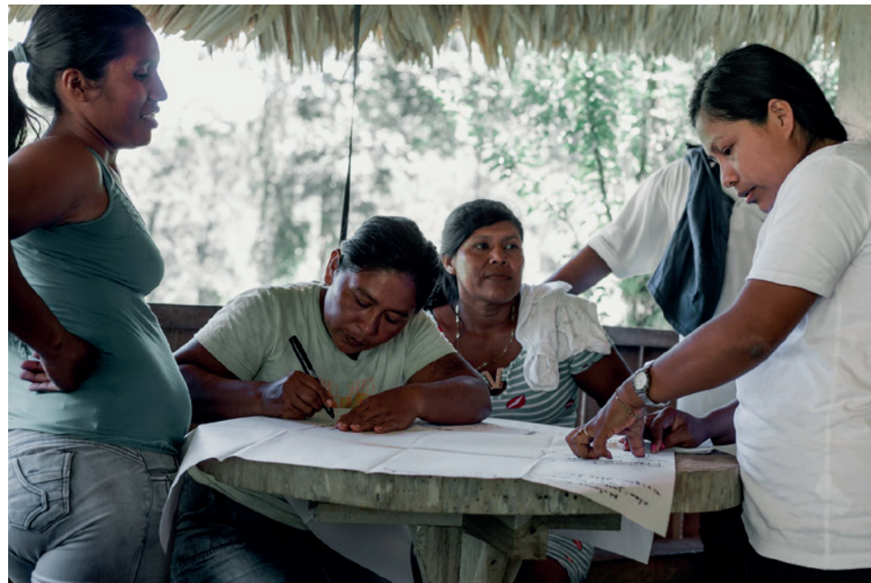
Women's empowerment workshops in Arenal in the rainforest of Talamanca