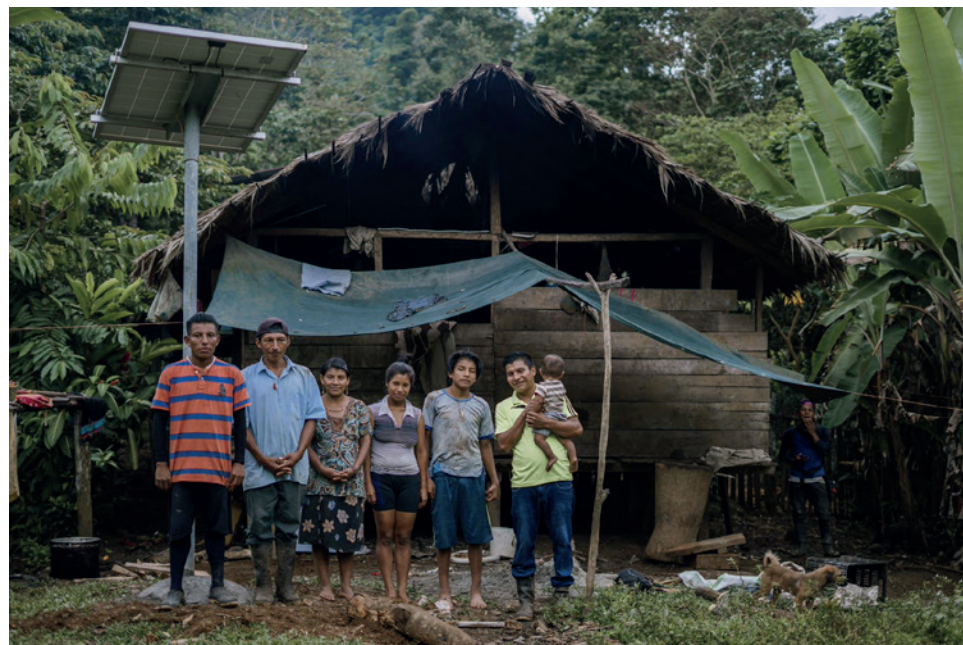
Cabécar family in the community of Orochico in the Talamanca rainforest