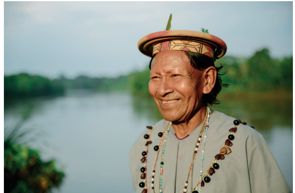
Secoya-Siekopai elder from the community of San Pablo in the Ecuadorian Amazon

At the intersection of effective climate action and the recognition of indigenous rights, the initiative follows a holistic bottom-up approach based on the self-formulated vision and historical cooperation of six Indigenous Peoples, including the A'i Kofan, Secoya-Siekopai, Siona, Waorani, Cabécar, and BriBri, who together protect more than 4.5 million hectares of primary rainforest in Central and South America.