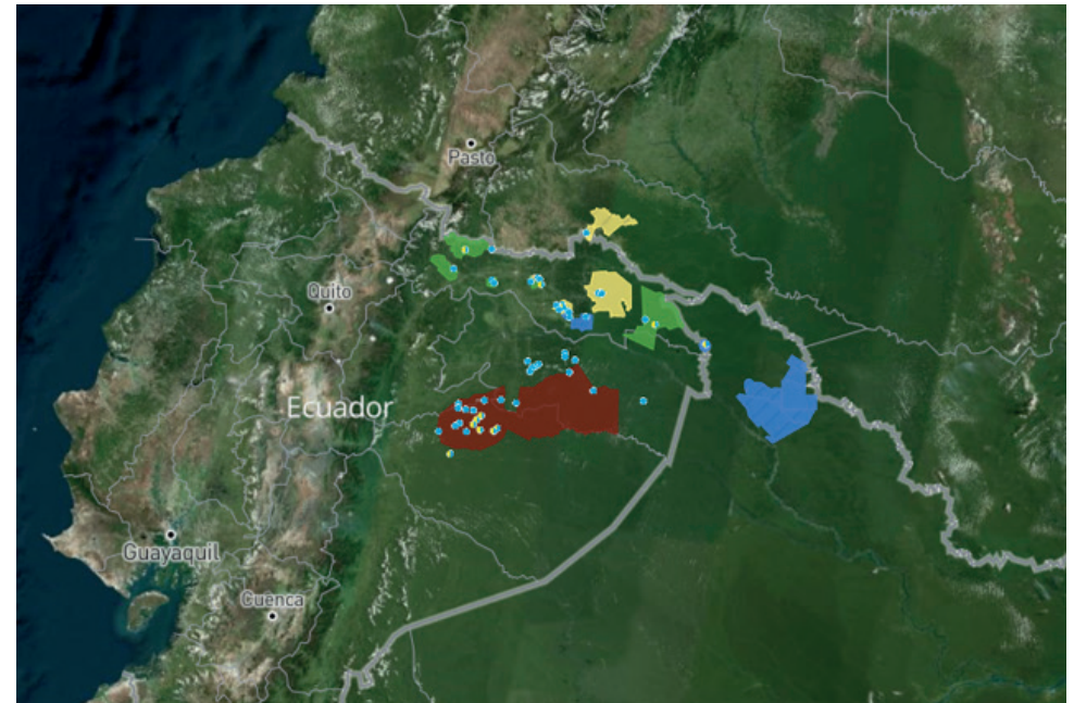
Ancestral rainforest territories of the four Indigenous Nations of Alianza Ceibo

+ Our Initiative includes the alliance with Amazon Frontlines and Amisacho Restauración, which are committed to regenerating the health of communities and ecosystems .