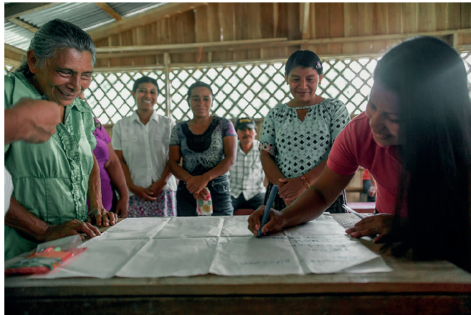
Women's empowerment workshops in Orochico in the Talamanca rainforest

The Women's Empowerment component combines the promotion of the inclusion of women together with the revival of their traditional handcrafting and knowledge, as well as the creation of productive activities based on their own culture and tradition. The women's empowerment program safeguards and revives the vital role of Indigenous women as protectors of the sacred and key holders of ancestral wisdom. Investment in women has a multiplier effect as they reinvest in their communities and society as a whole benefits.