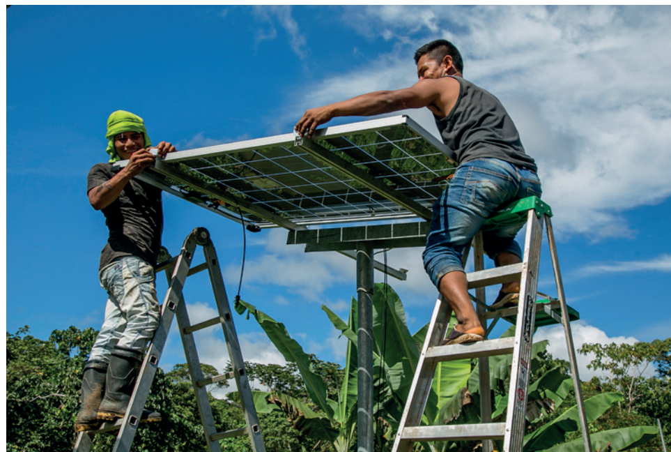
Solar home system installation in the community of Mañoko in the Peruvian Amazon