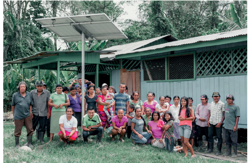
Cabécar people after the community training in Orochico, Talamanca rainforest

Local ownership and empowerment are at the heart of the Initiative's goals to make sure that power is generated long after system installation. We have built comprehensive and self-sustainable regional infrastructures (including the set up of two training facilities, trained indigenous solar technicians, developed training material in six different languages, etc.) in Central and South America ensuring successful replication and up-scaling of sustainable solar energy solutions for last-mile populations.