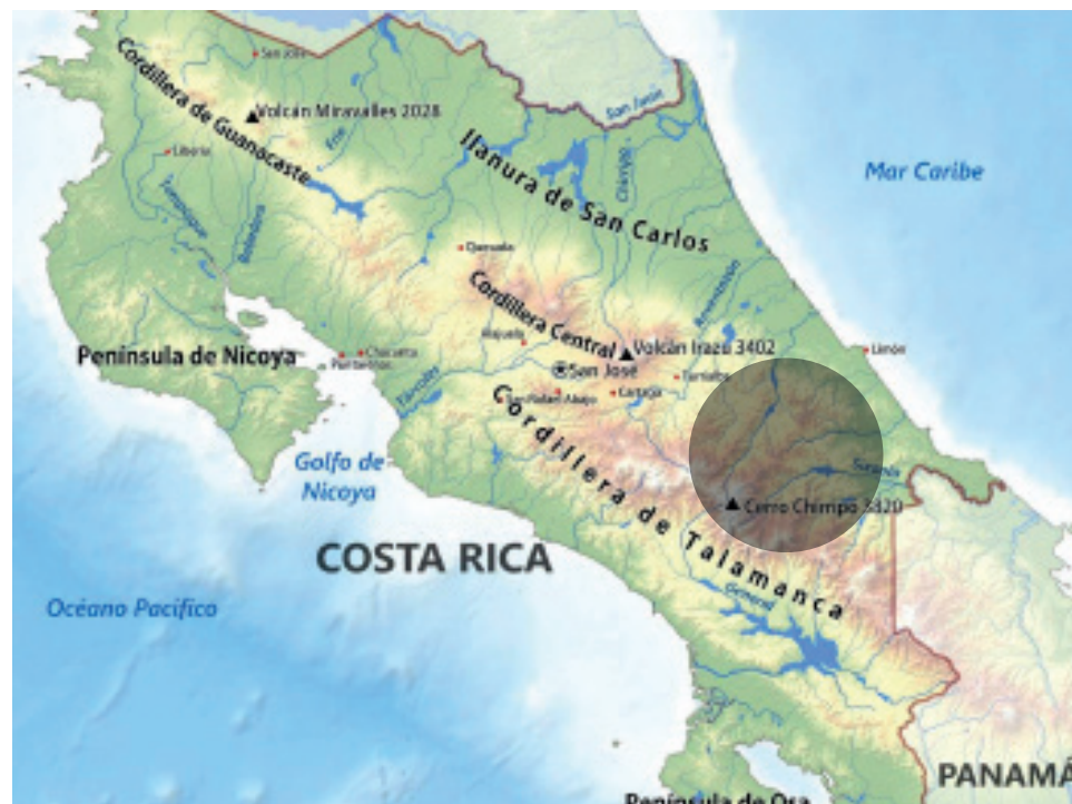
Cabécar-Bribri rainforest territories where the solar energy initiative is implemented in partnership with ADITICA

+ For project sustainability we have established strategic alliances with governmental institutions , such as the Instituto Costarricense de Electricidad (ICE) and the Ministry of the Presidency