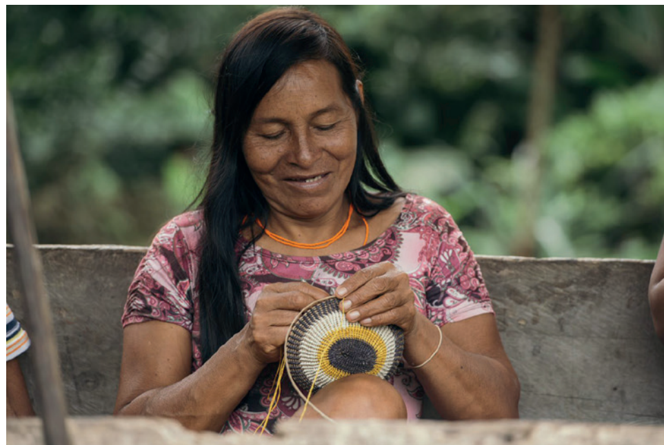
Worani woman working on traditional handicrafts in Acaro in Ecuador's Amazon