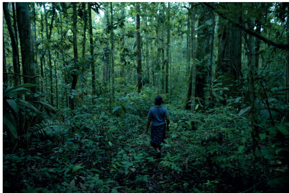
Secoya-Siekopai woman from the community of Mañoko in Peru