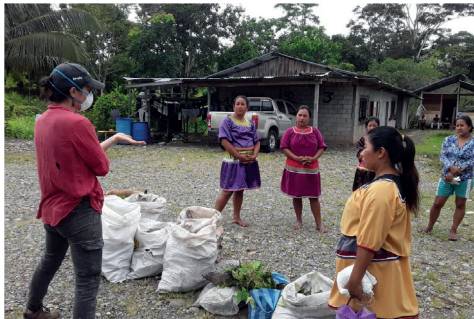
Local food and seed packages for A'í Kofán families in Ecuador's Amazon rainforest