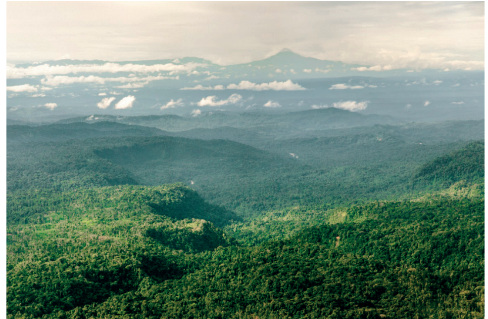
North-eastern Amazon rainforest of Ecuador

The regional Initiative in Latin America ensures the conservation of ecosystems and protects the biological and cultural diversity in megabiodiversity hotspots in the Amazon rainforest of Ecuador, Colombia, and Peru as well as in the Talamanca rainforest of Costa Rica. In direct partnership with six Indigenous Peoples, the initiative combines nature-based, innovative, and traditional approaches for biodiversity conservation with the creation of sustainable access to clean, safe, and independent solar energy.