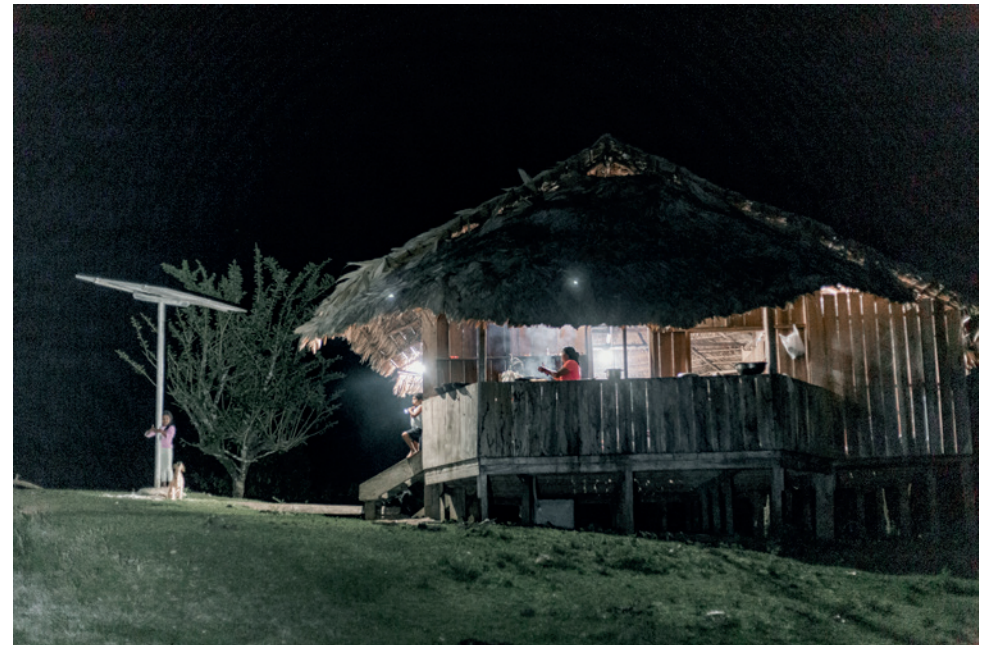
Cabécar house illuminated by the new solar home systems in Talamanca

The Initiative combines the use of smart regenerative technology and intensive capacity building programs along with an alternative and cultural-sensitive payment model. So far, we have completely solar-electrified 33 remote rainforest communities in five different Indigenous territories in four countries and empowered six Indigenous Nations that together guard and protect more than 4.5 million hectares of pristine rainforest territory.