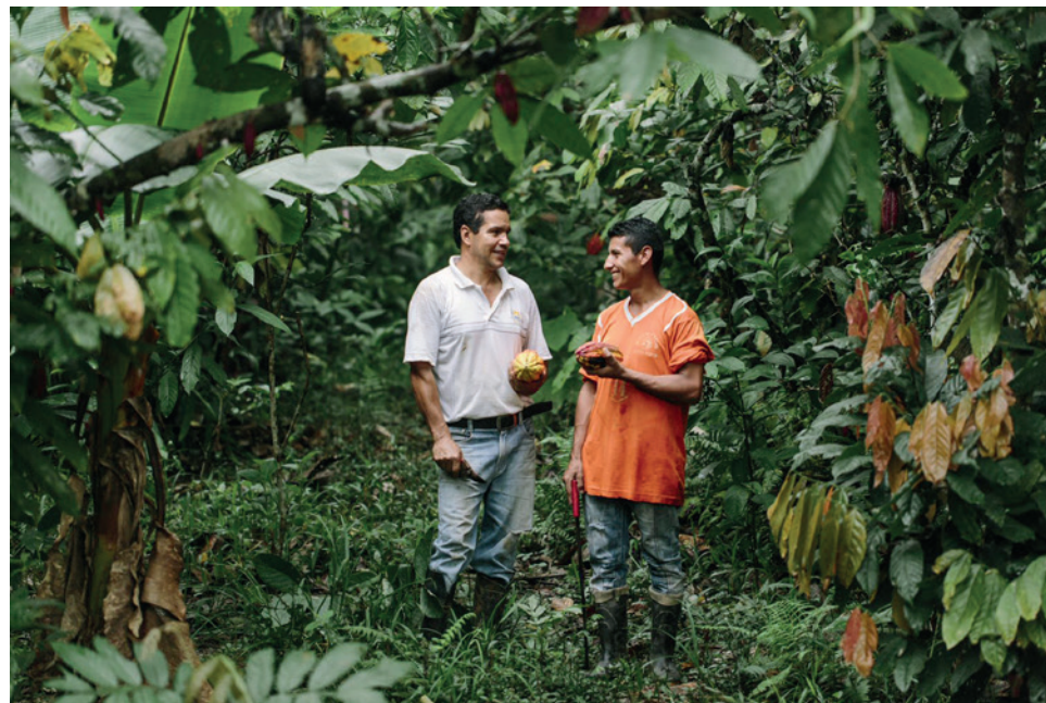
Restored jungle in previously contaminated rainforest area in north-eastern Ecuador

And more recently, LOVE FOR LIFE together with its local partners in Costa Rica and Ecuador has set up action plans towards nature-based and Indigenous-led solutions to respond to the COVID-19 crisis. As part of these plans, in the last three months, 400 Indigenous families in Talamanca and the Amazon rainforests have been able to have access to local food by reviving ancestral practices, cultivating and safeguarding native seeds and strengthening their own local production systems.