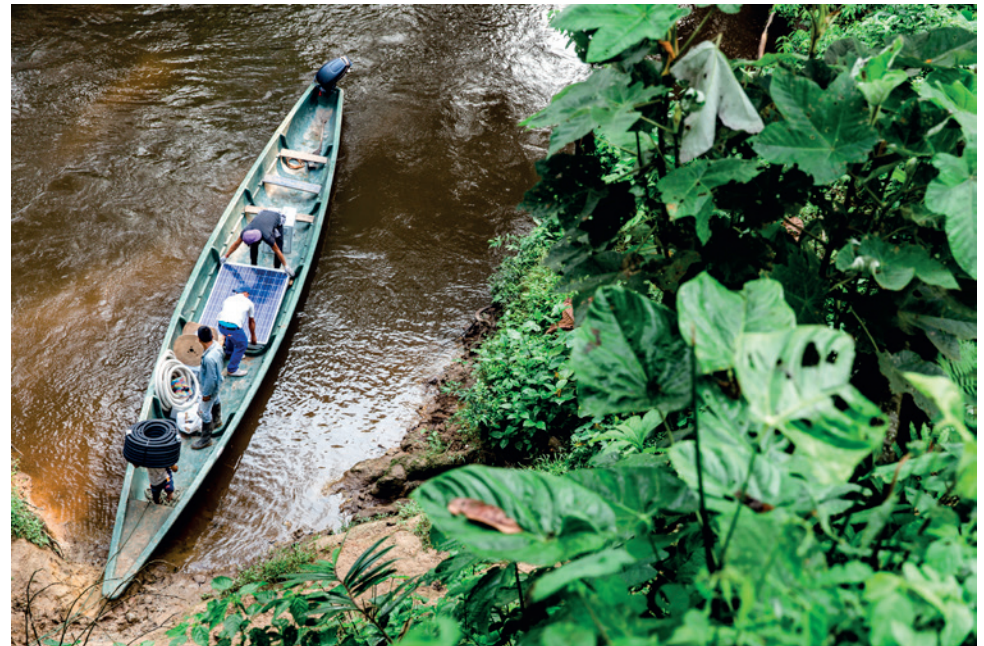
Transportation of solar system materials in the Amazon rainforest