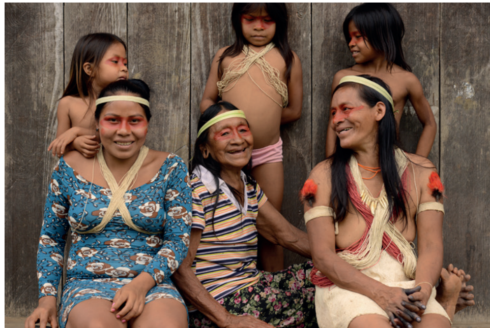
Four generations of a Waorani family in the rainforest community of Acaro, Ecuador

Tropical forests are among the most species-rich ecosystems on the planet. Although they cover less than 10% of the global surface, more than half of the world's flora and fauna live in them. They are crucial for the water and carbon cycle and serve as an important carbon sink. According to the Global Forest Resources Assessment of 2020, there are only about 1.11 billion hectares of primary forest left on Earth. Although, Indigenous Peoples play a key role in global biodiversity protection and effective climate action they have received only marginal attention in national and international strategies and projects.