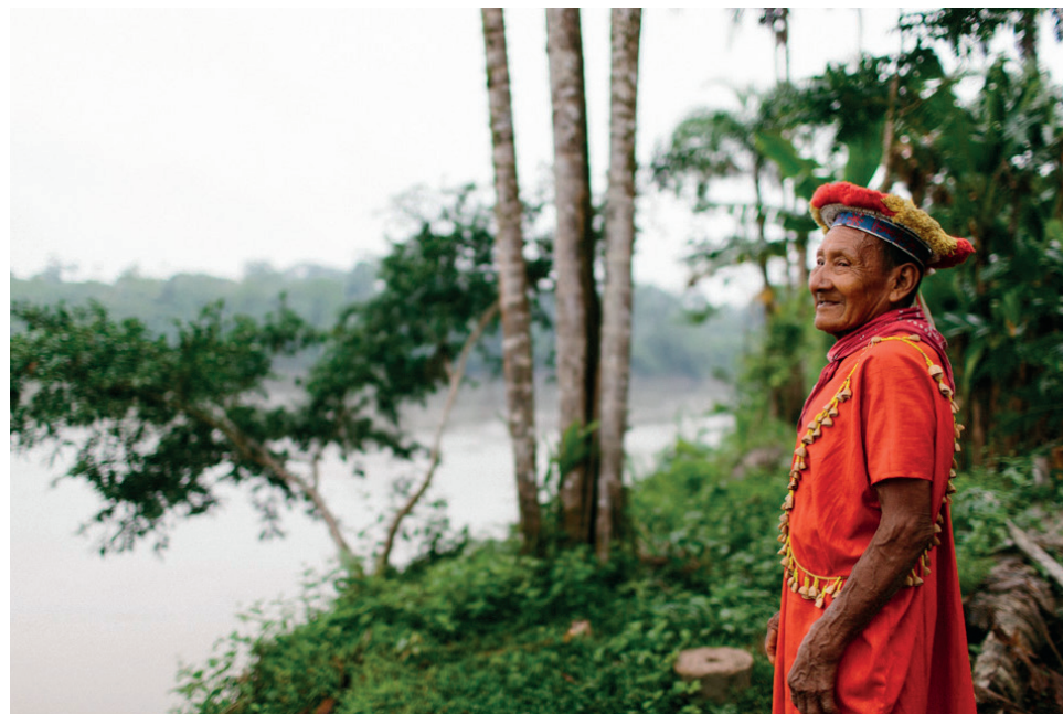
Secoya-Siekopai shaman in the community of San Pablo along the Aqua Rico river