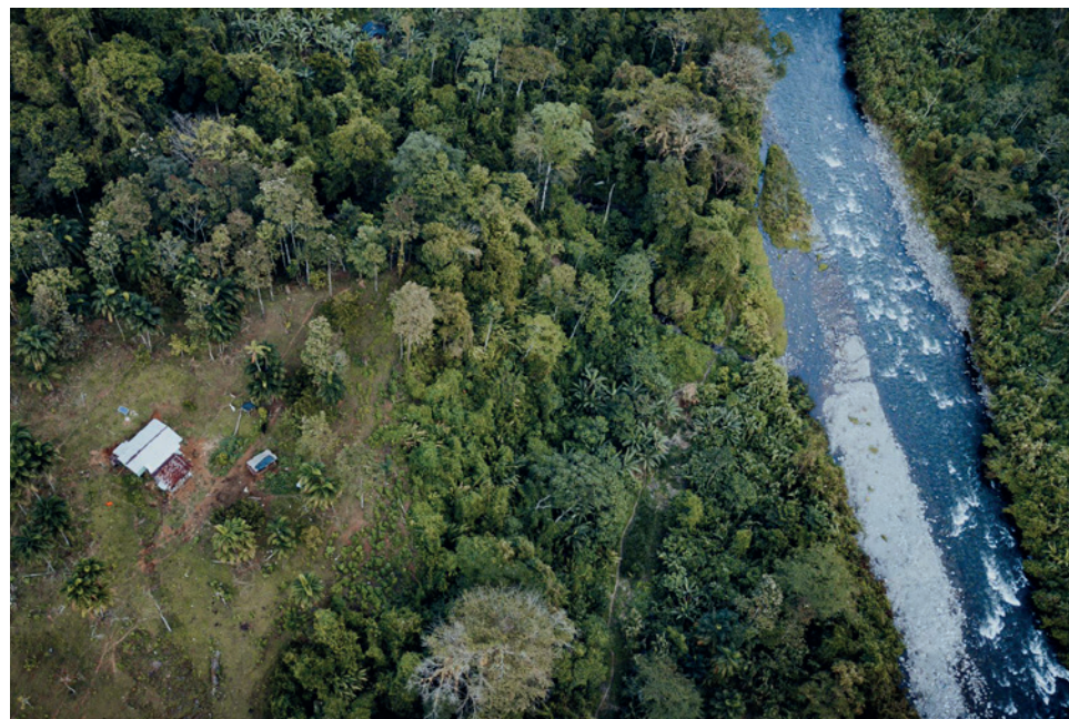
Cabécar territory in the Talamanca rainforest in Costa Rica

The north-south and south-south collaboration as well as the multi-stakeholder approach of the initiative show to what extent the implementation of biodiversity protection, climate action, and sustainable development goals can succeed through the exchange of knowledge and in direct partnership with Indigenous Peoples, civil society as well as public and private actors.