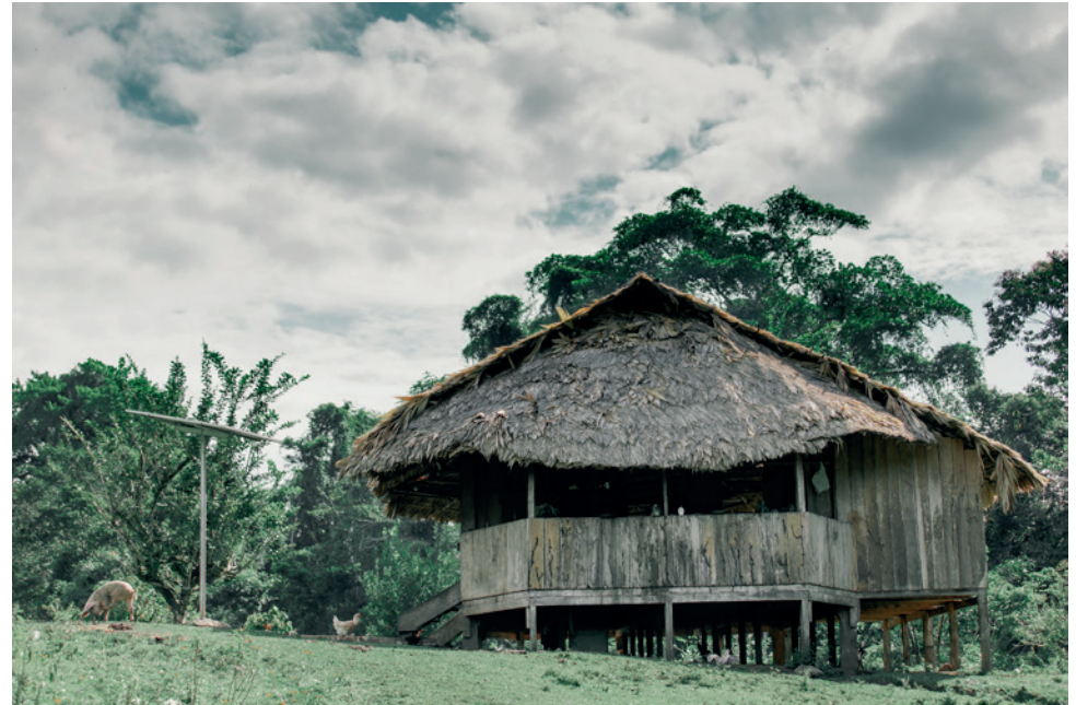
Traditional Cabécar house with solar home system in the Talamanca rainforest

LOVE FOR LIFE focuses on precisely this goal to create sustainable and clean energy access for the most vulnerable and hardest to reach people. In particular, LOVE FOR LIFE has proven to successfully implement holistic, community-led solar energy projects in the most remote places on Earth by building local capacities and strategic partnerships for long-term project sustainability.